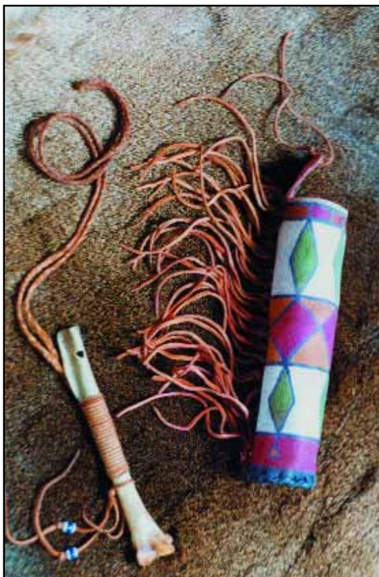
Below: ceremonial eagle leg bone whistle and painted rawhide protective case

beads here and there. I intended there to be four, one for each sacred Direction, around the handle. But because of the diameter of your raven feather quill this made my intended pattern impossible. So I had to do three - one for each world - that was Spirit's intervention in the design and actually that seems to suit you better, as I know you work a lot with the three worlds and not so much with the Four Directions. I don't believe in accidents - that's just Spirit sticking it's oar in!