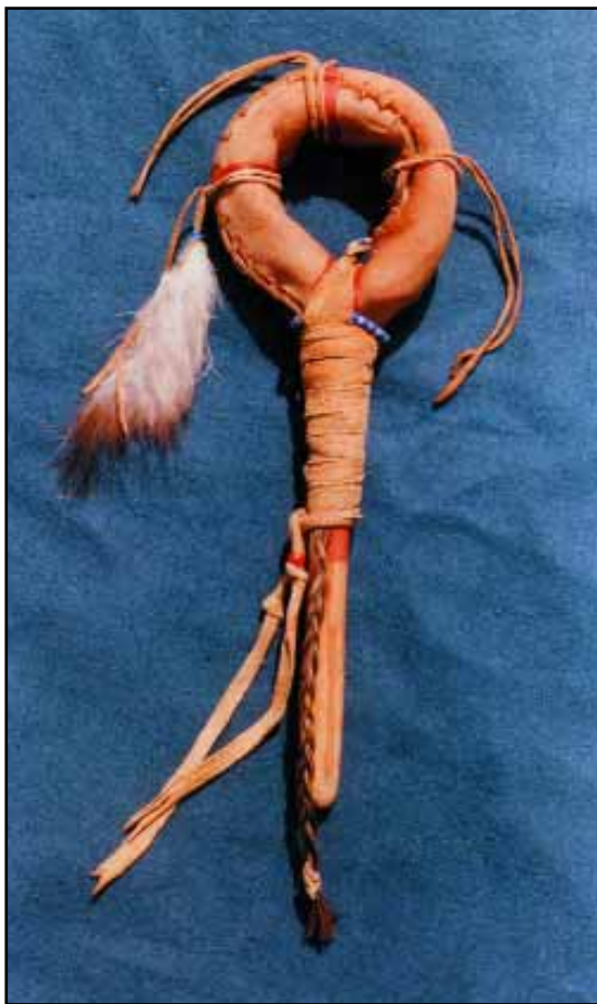
Above: copy of a Native American men's society 'doughnut' rawhide rattle